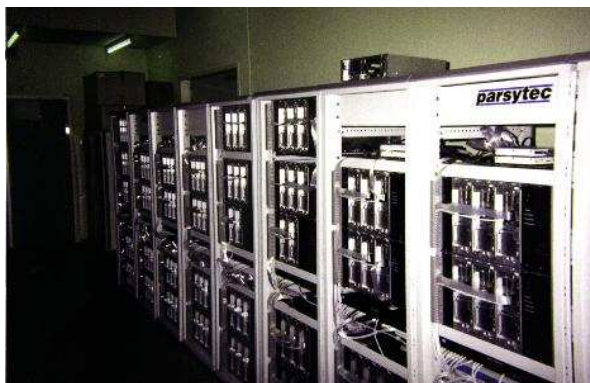
Figure 2: The 128-node DAS cluster at the Vrije Universiteit.

This setup allowed us to compare a dedicated fixed Quality of Service network with a best effort network. The best effort network consists generally of 100 Mbit/s Ethernet connections to a local infrastructure; each university typically had a 34 Mbit/s connection to the Dutch backbone, later increased to 155 Mbit/s. The ATM connections are all 6 Mbit/s constant bitrate permanent virtual circuits. The round trip times on the ATM connections have hardly any variation and typically are around 4 ms. On the best effort network the traffic always has to pass about 4 routers, which cause a millisecond delay each. Measurements show that the round trip times vary by about an order of magnitude due to the other internet traffic. Attainable throughput on the ATM network is also constant. On the best effort network, the potential throughput is much higher, but during daytime congestion typically gives throughputs of about 1-2 Mbit/s. This problem improved later during the project.